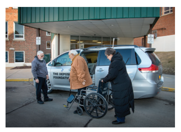
A Deposit Foundation volunteer driver drops off a Deposit resident in Binghamton for a health care appointment.